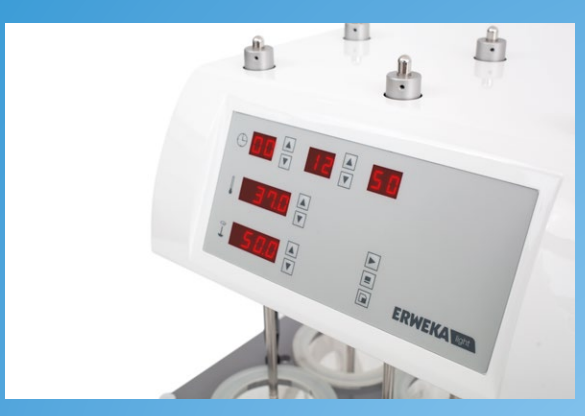
FD display and symbol keypad for easy control