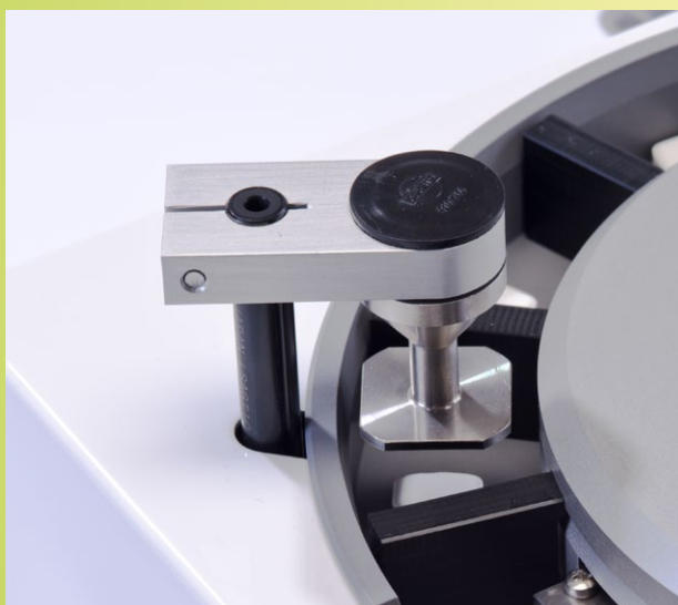
Optional thickness testing via a linear potentiometer*.